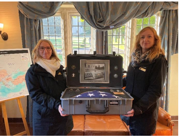
Two members of the Aisne-Marne staff hold the Centennial Flag case upon the conclusion of the ceremonies