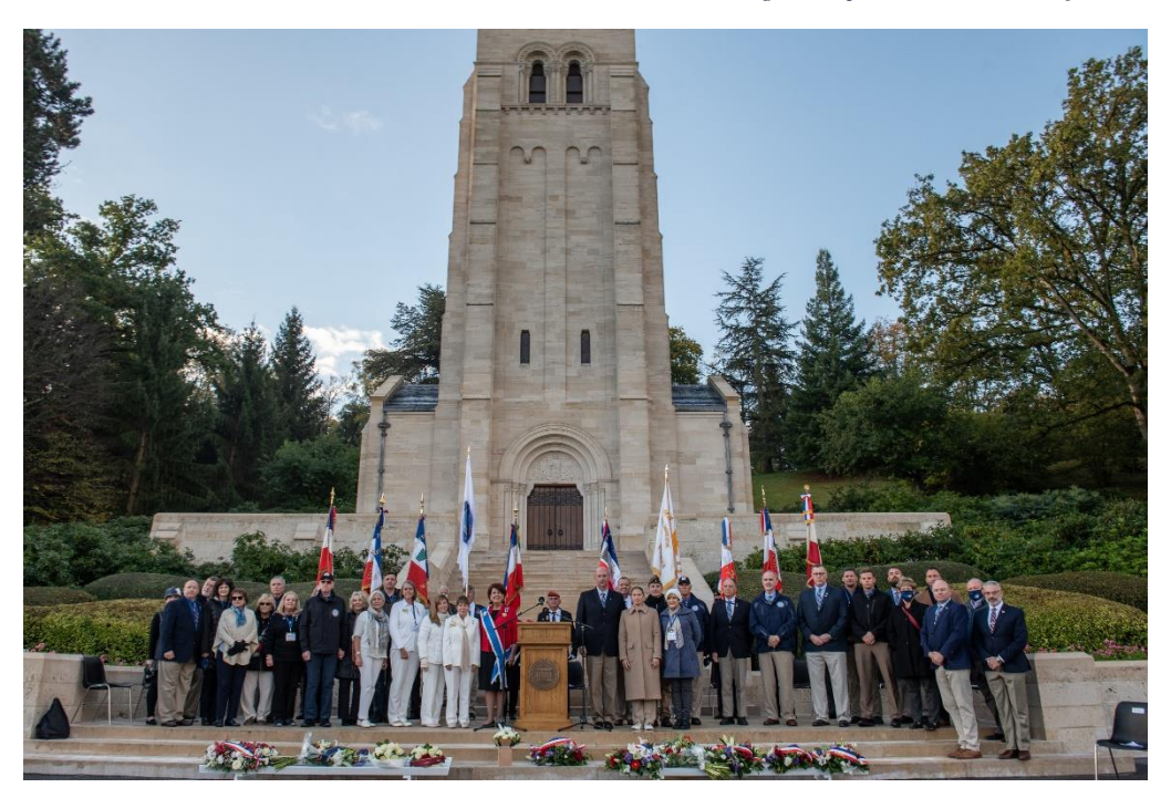
Members of the delegation gather at the chapel with the flag bearers

The next stop for the Centennial Flag is the Aisne-Marne American Cemetery on the afternoon of October 22^{\text{nd.}} .