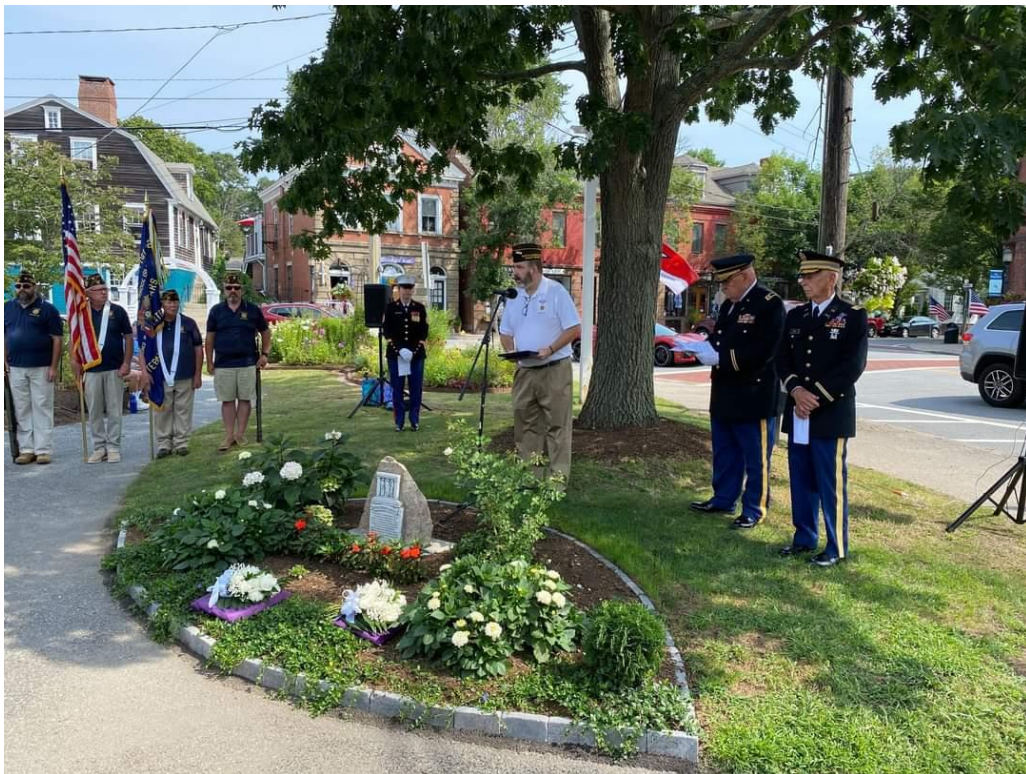
Never Forget Garden Dedication in North Kingstown, Rhode Island on August 7, 2021

An updated list of events around the US and overseas is attached , changes are highlighted in yellow .